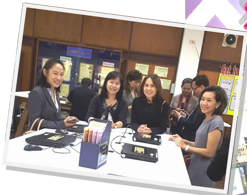
A visitors with CULI Administrators.