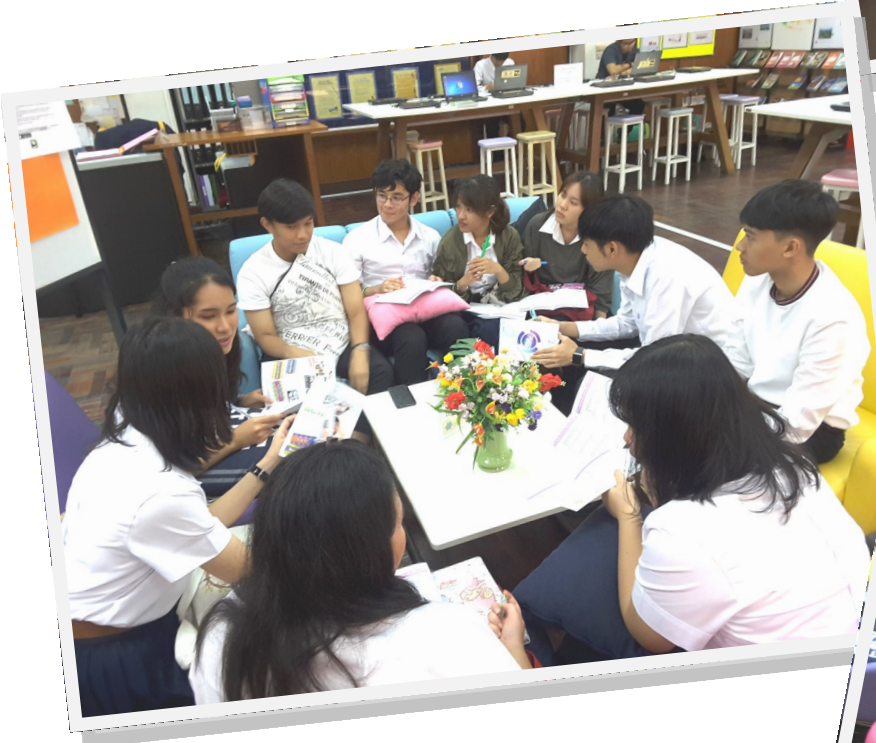
Let's Chat activity get crowded.