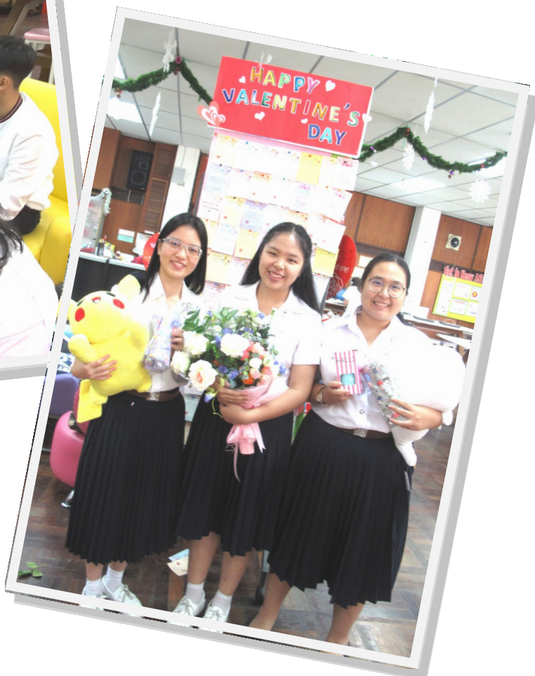
The lovely students join Valentine's day activity.